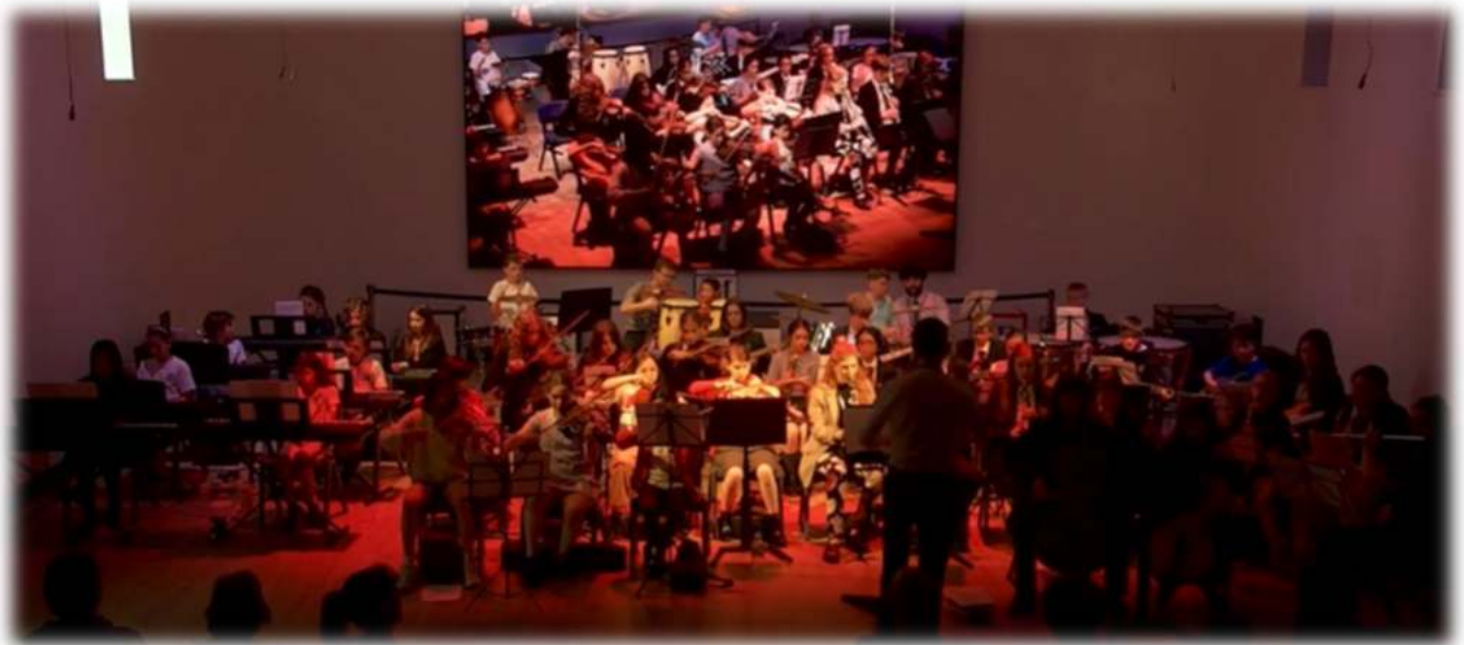
The Summer 2024 Primary Orchestra performing in the Performance Space at The Winston Churchill School