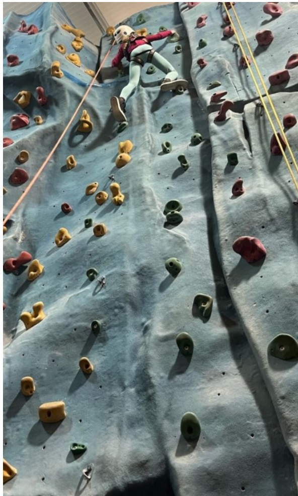
Jamie (Penguin Class)

Well done to Jamie (and her brother Ben—Year 6) for conquering this very daunting climbing wall. It is great to see you trying something new, whilst showing courage and determination to reach the top!